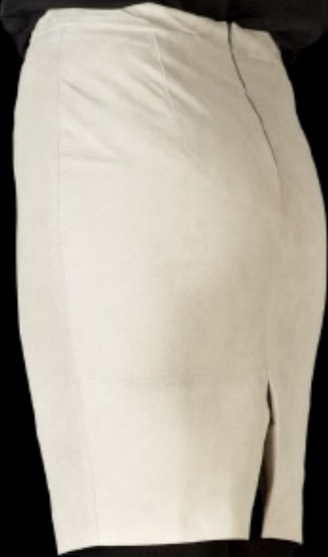
01-1-05-204 multicolour yellow / grey / blue suede