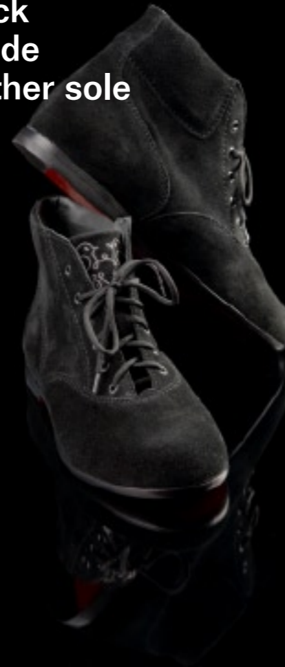
01-1-10-203 grey suede leather sole