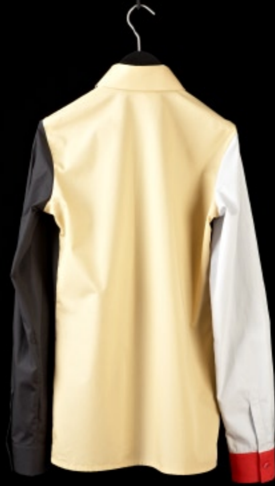
01-1-07-105 multi colour blue red grey cotton