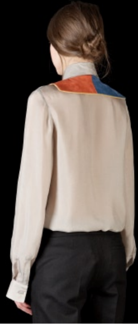
01-1-01-005 blue red grey suede