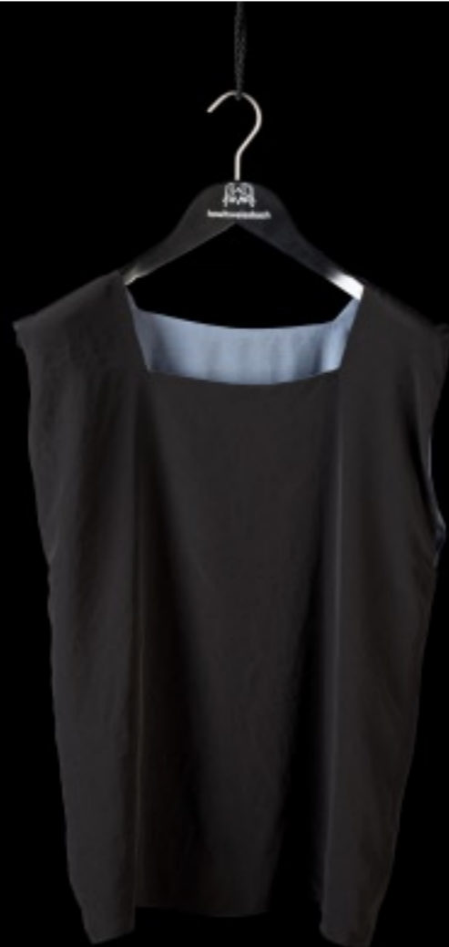
01-1-07-004 reversible black / black cupro high end PES (japan)