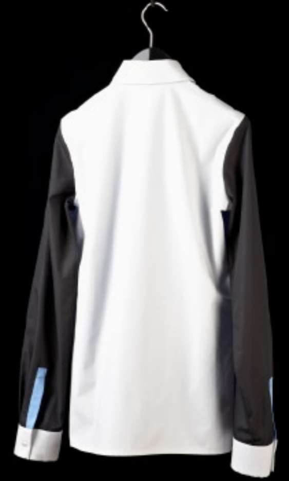
01-1-07-103 multi colour yellow red black grey cotton