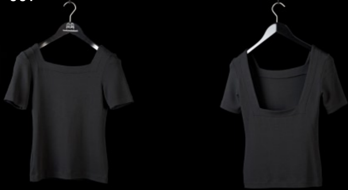
01-1-11-002 black jersey