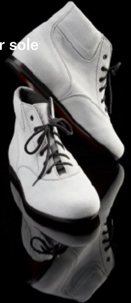
01-1-10-204 yellow suede leather sole