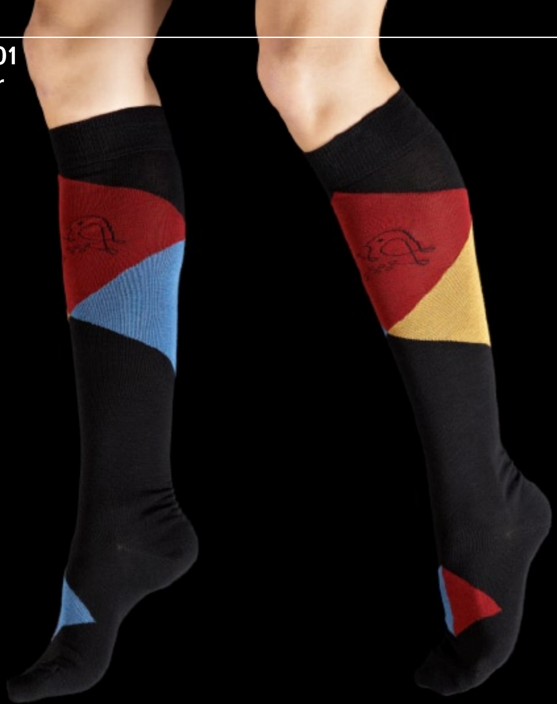
01-1-02-006 multi colour cotton