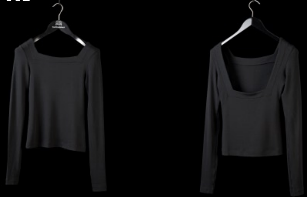
01-1-11-003 black jersey