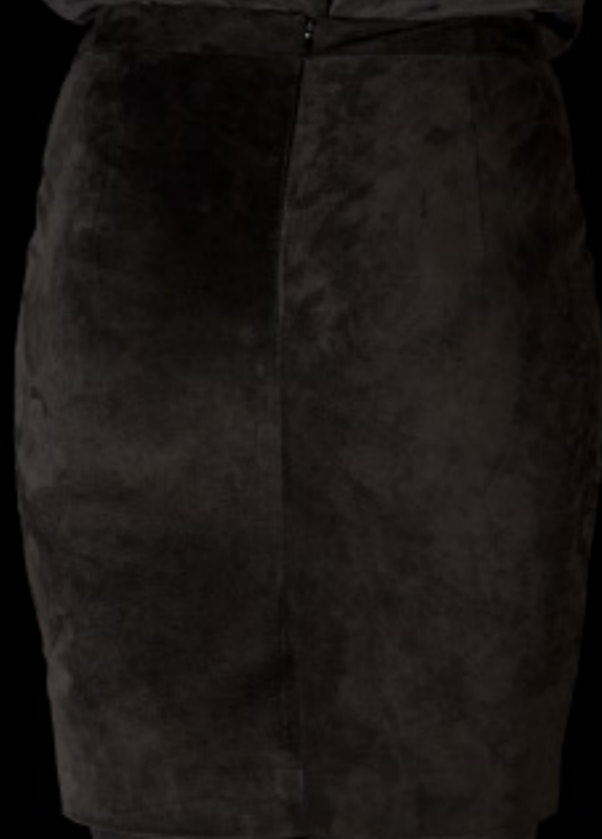
01-1-05-205 red suede