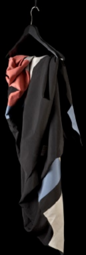
01-1-01-003 blue grey / black cupro high end PES (japan)