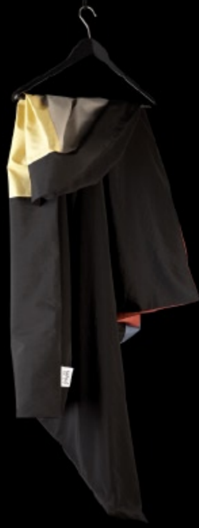
01-1-01-002 multi colour cupro high end PES (japan)