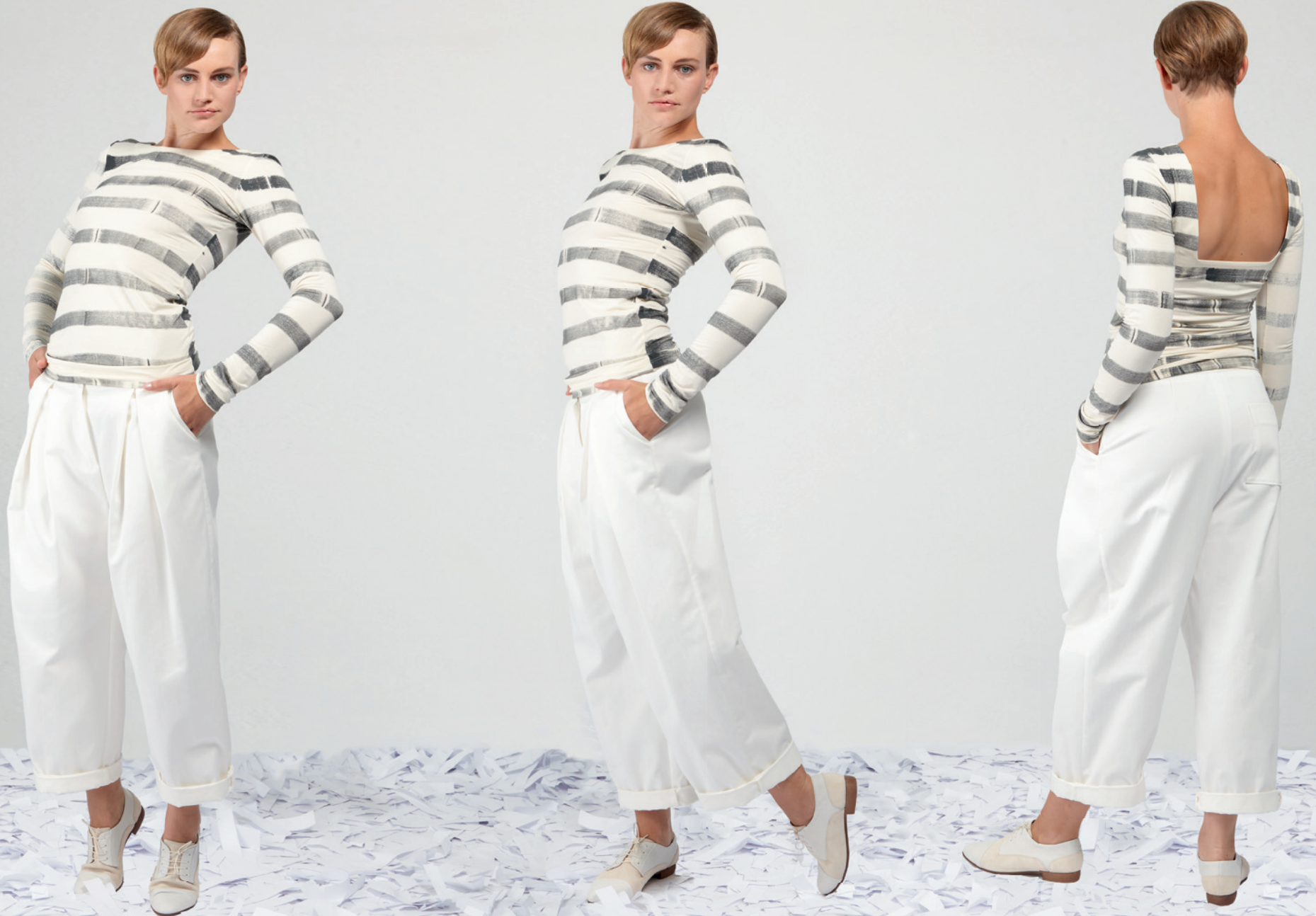
shirt and trousers 1928