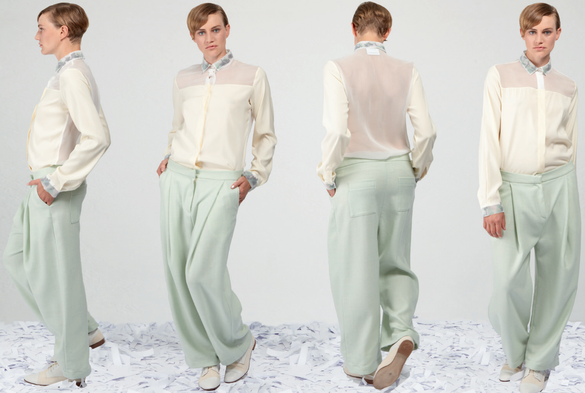
shirt and trousers 1920